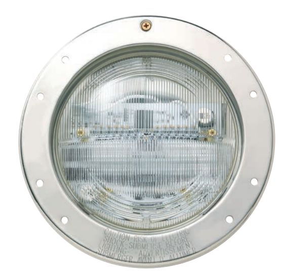
IntelliBrite 5g Light