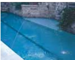
Single 3/16" Stream