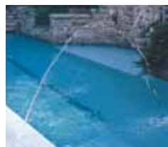
Single 5/16" Stream