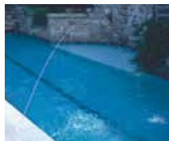
Single 1/4" Stream